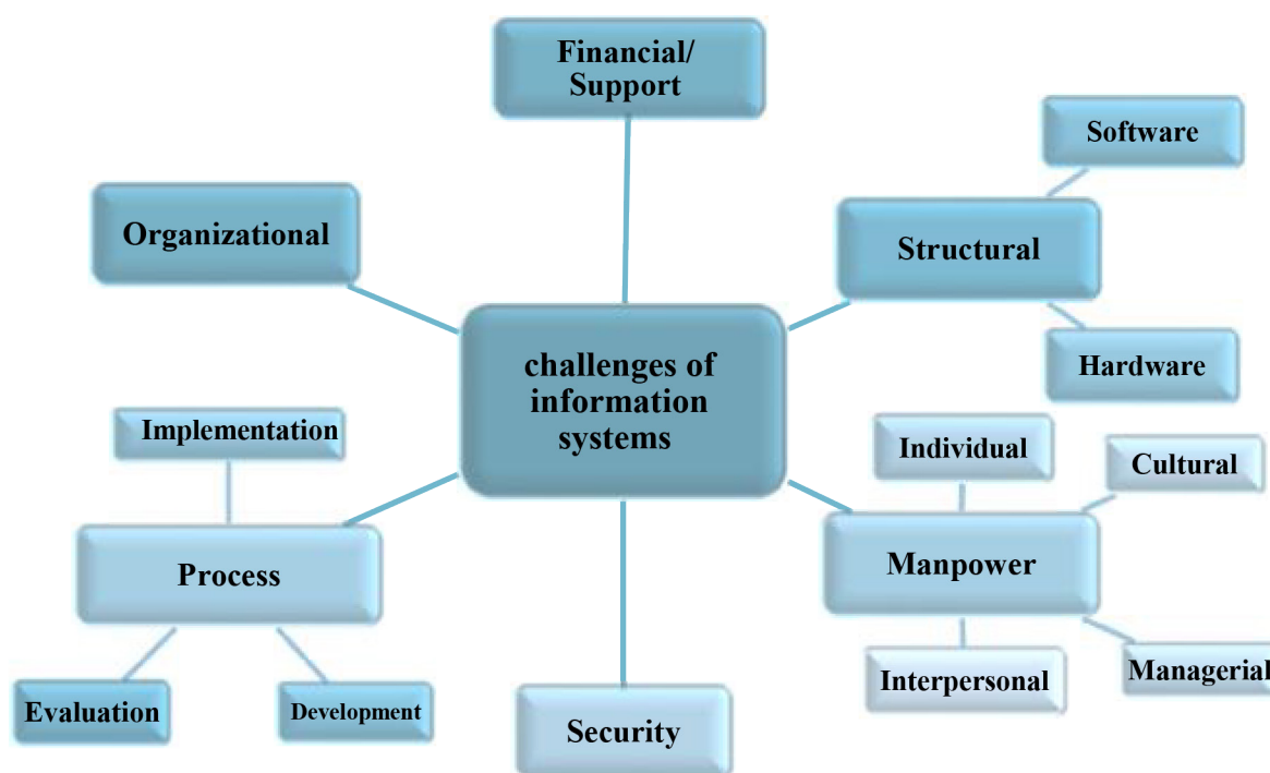
Figure 2: Themes of Information System's Challenges